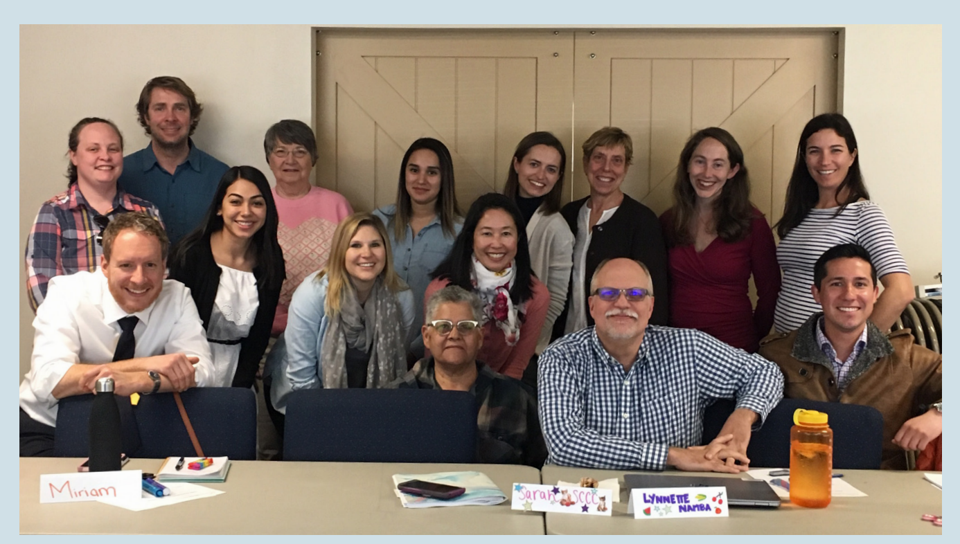
ASCENT Cohort, April 2019 in Longmont.

Since 2016, CHI has convened the Specialty Care Stewardship Council (SCSC), a group of C-suite health care leaders developing a statewide specialty care safety net.