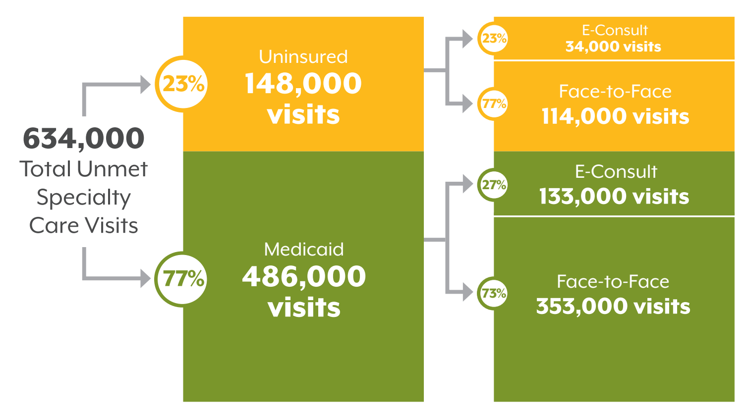
Figure 1. Unmet Demand for Specialty Care among Adults (19-64) Without Insurance and Those Enrolled in Medicaid, Colorado

It would cost about $93 million annually – or $47 million if we account for Medicaid reimbursement – to cover all of Colorado's unmet specialty care visits.