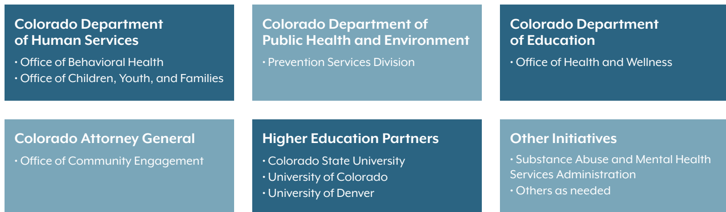
Figure 2. Colorado’s Leads for Implementing the Statewide Strategic Plan for Substance Abuse Prevention

Communities That Care: Mobilizes community stakeholders to collaborate in selecting and implementing evidence-based prevention approaches.