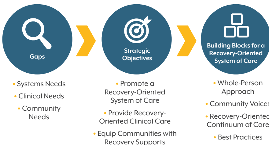
Figure 2. Elements of the Strategic Plan

Support programs are often staffed by people with shared experiences of substance use recovery. Programs include one-to-one support, group support, and substance free social activities.