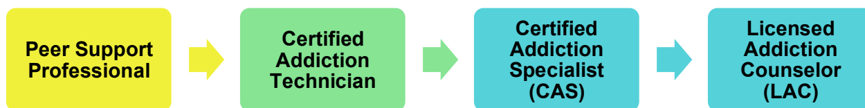
Figure 2. Addictions Counselor Pathway

Purpose: Show how an individual with lived experience can progress through Colorado's addiction counseling credential ladder toward independent practice as a licensed addiction counselor (LAC).