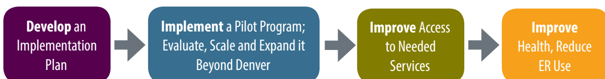
Figure 1. Theory of Change Model for a Pilot Specialty Care Referral Network

The report also contains sidebar material reflecting significant health policy developments underway and the unique characteristics of Denver’s health care market. A comprehensive timeline for carrying out the tasks is included in Appendix 1.