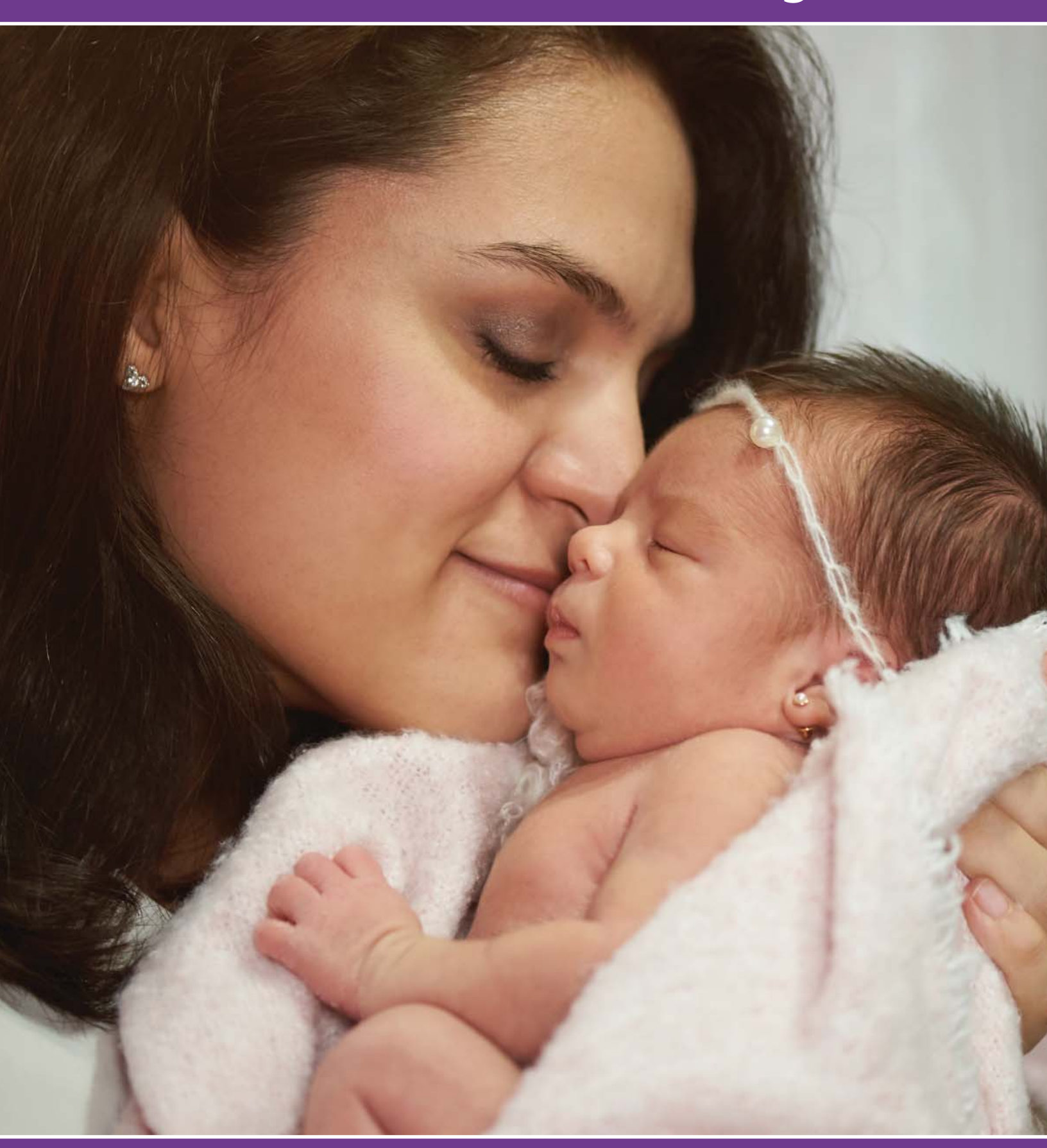
A Guide for Parents and Families