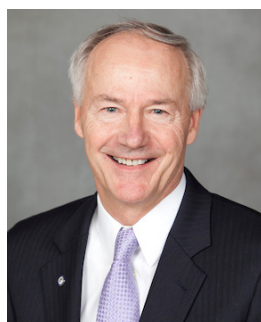
Governor Asa Hutchinson

Arkansas Governor Asa Hutchinson has said he is interested in how an innovation waiver can play a role in the future of the private option.